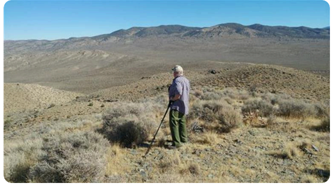
Looking for deer on Hot Springs Mt. Nov 05, 2018