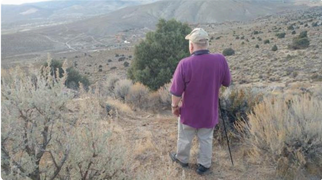
Dad scouting for his last deer hunt Nov 5, 2018